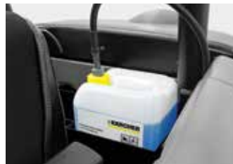
Cleaning agent dosing unit

For dark areas, such as in parking lots or in logistics areas, the work lights improve vision and make the machine easier to see.